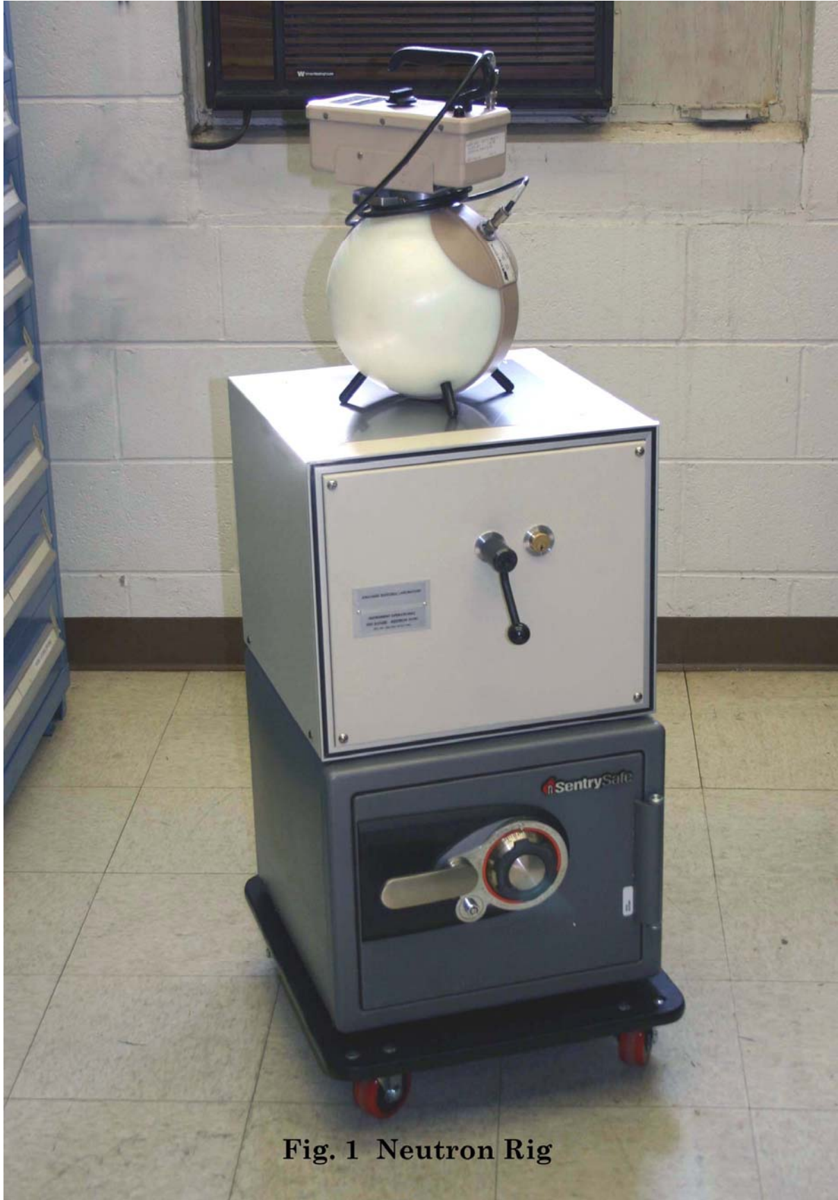
Fig. 1 Neutron Rig